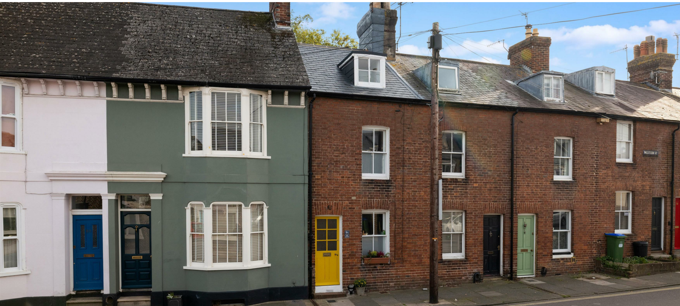
Western Road, Lewes